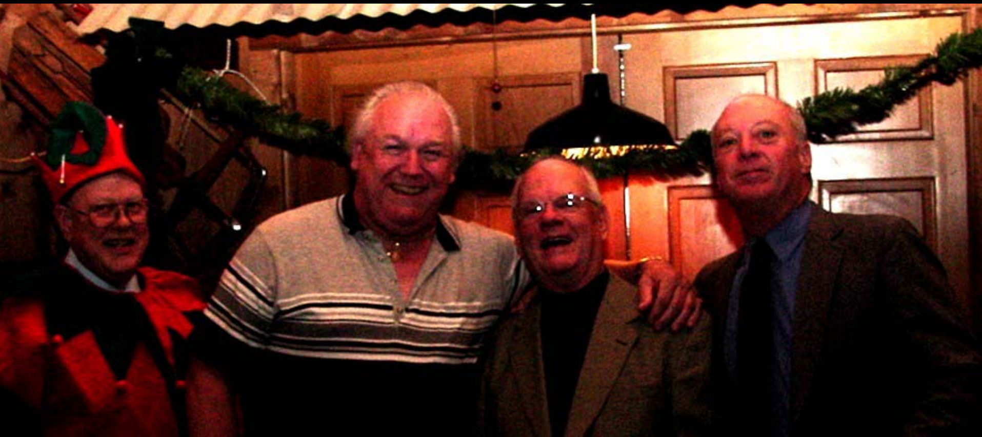
Nippy & the Three Musketeers