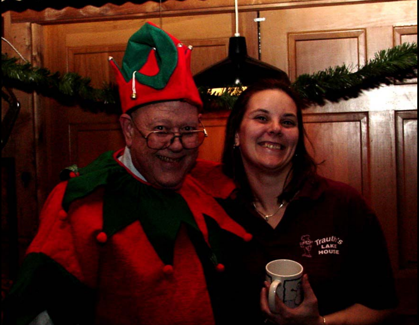
Nippy & Waitress #2