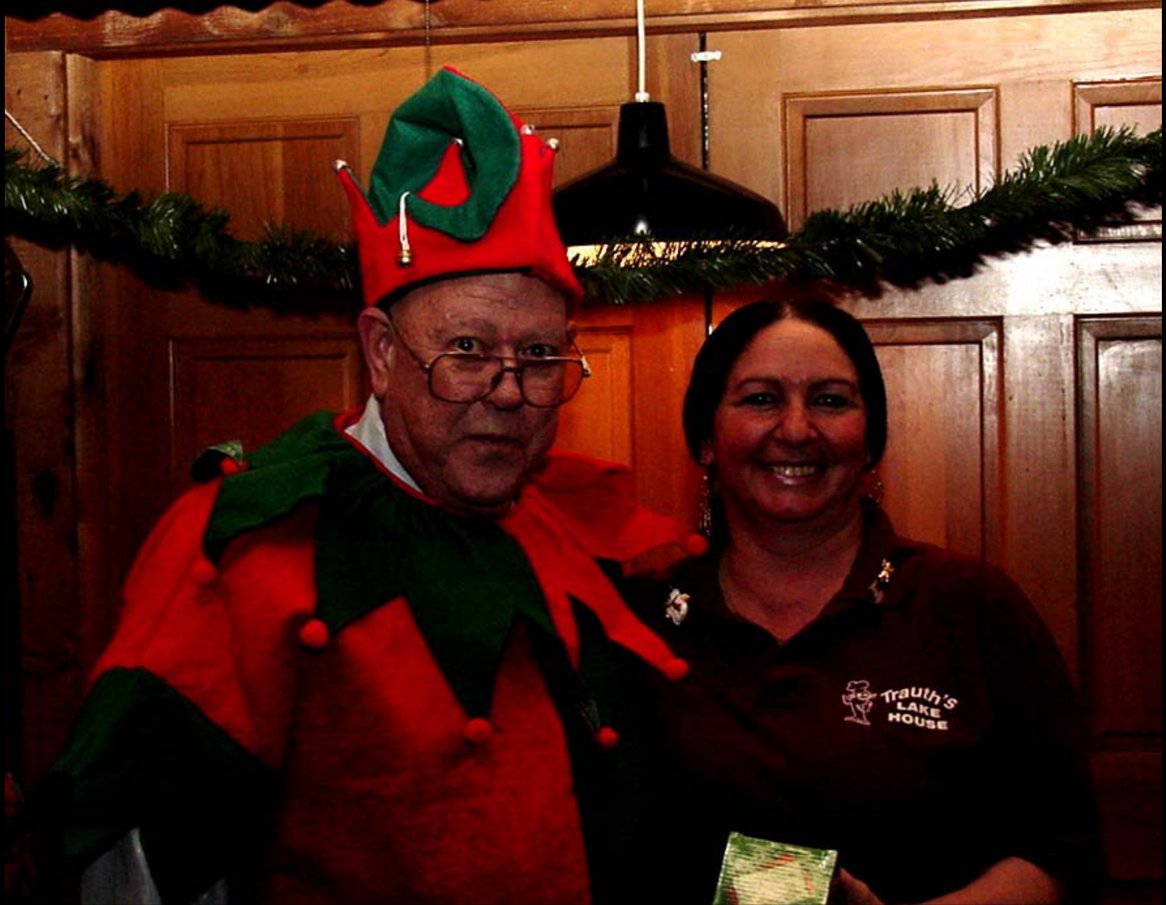
Nippy & Waitress #1